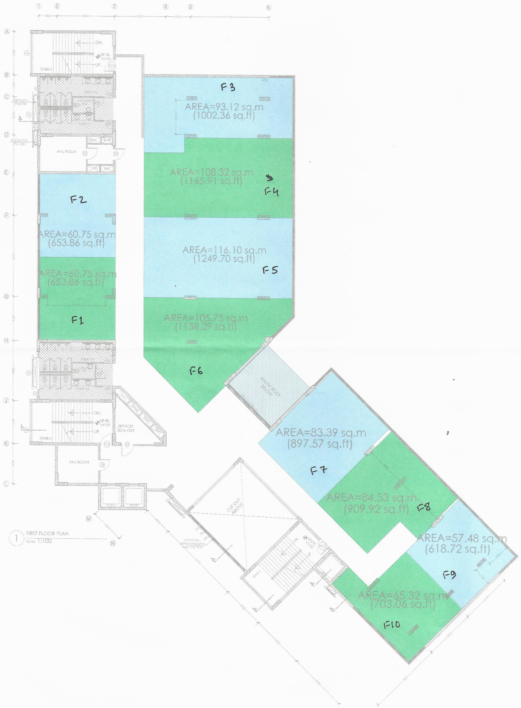
1 FIRST FLOOR PLAN SCALE 1:100