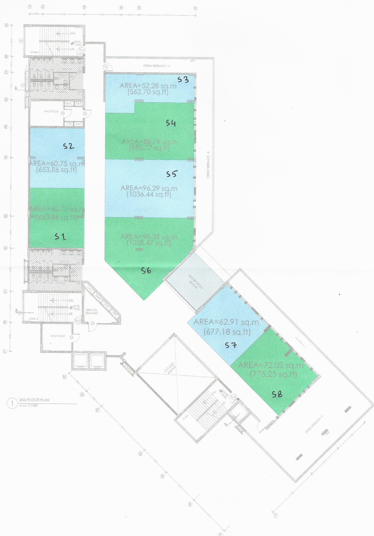
1 2ND FLOOR PLAN SCALE 1:100